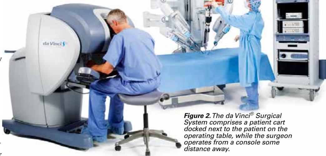
Figure 2. The da Vinci ® Surgical System comprises a patient cart docked next to the patient on the operating table, while the surgeon operates from a console some distance away.

in the prostate. With PSA blood tests becoming easily accessible over the last 20 years, the majority of men with prostate cancer are now diagnosed at an early curable stage of their disease.